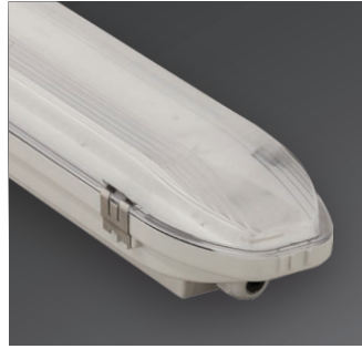
Narrow beam optics

Our transparent diffuser made of UV-stabilized material achieves an outstanding light transmissivity up to 93% . This great light permeability offers high efficacy (up to 157 lm/W) emitted from the luminaire.